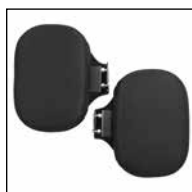
Upper body guide, firm