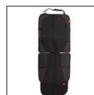
Car seat protection mat incl. back