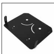
Tilting function 10° (0° / 2,5° / 5° / 7,5° / 10°)