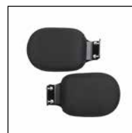
Lateral trunk supports, firm