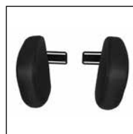
Upper body guide, swing-away