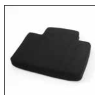
Cushion for function base