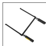
Seatfix adapter, behind the seat