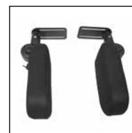
Lateral trunk supports, swing-away