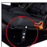
Extension Tilting function 12,5 - 20° (12,5° / 15° / 17,5° / 20°)