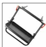
Footrest, foldable (height and angle adjustable)