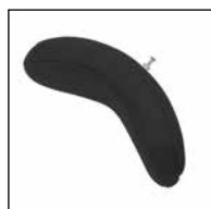
Headrest, height adjustable