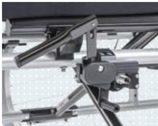
Wheel lock lever extension