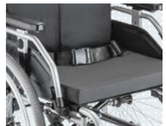
Lap belt with closure