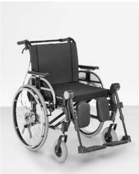
► Start M4 XXL – The model for special sizes Lightweight segment