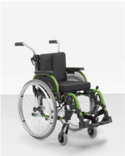
► Start M6 Junior – The model for kids Lightweight segment