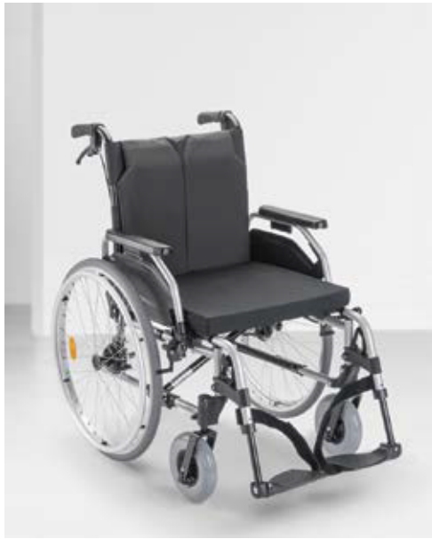
► Start M2 – The configurable model Lightweight segment