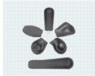
Arm and hand support