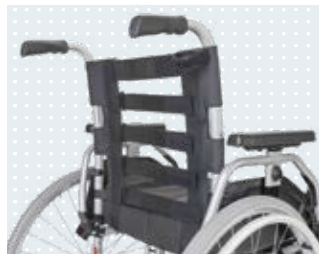
Economy Ergo back support upholstery