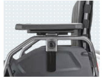
Height-adjustable forearm support