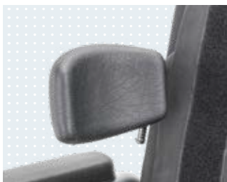
Lateral thoracic support