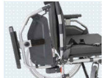
Swing-away side panel